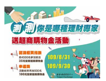
What Kind of Financial Management Expert Are You?

In response to the pandemic, TPEx encouraged investors to engage in epidemic prevention while acquiring knowledge of passive investment between April 27 and May 24, 2020, promoting the "TPEx 200 Index" and related index-linked products.